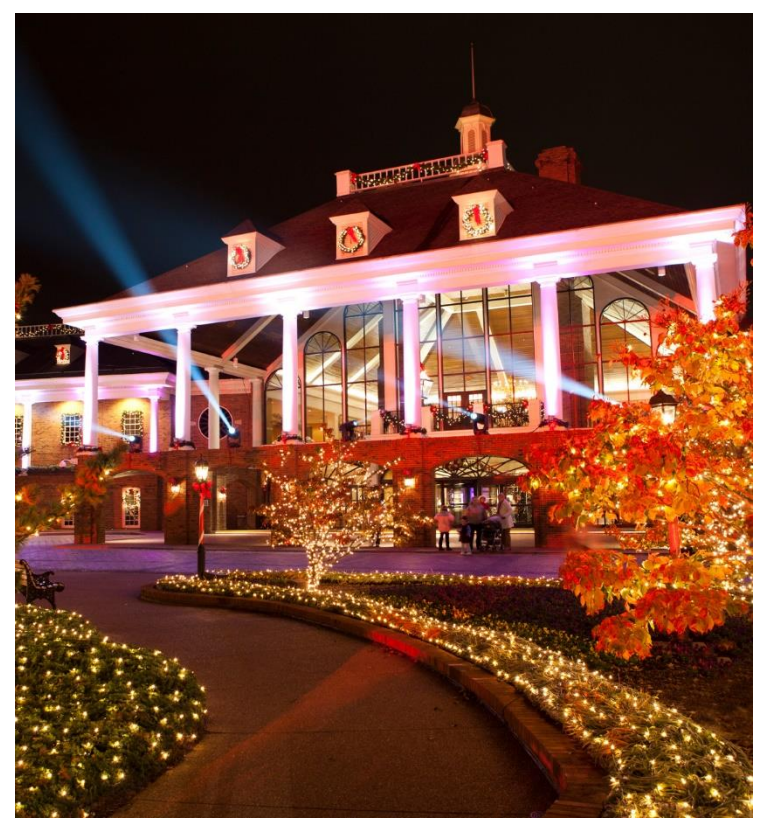
8 Days • 11 Meals: 7 Breakfasts, 4 Dinners

HIGHLIGHTS... French Quarter, Jazz Revue, Grammy Museum, Graceland, Civil Rights Tour, Ryman Auditorium, Hands-on Chocolate-making Lesson, Grand Ole Opry Show, Historic RCA Studio B, Country Music Hall of Fame, Gaylord Opryland Resort Dinner & Holiday Show, Choice on Tour: Delta River Flat Boat or Horse-Drawn Carriage Ride